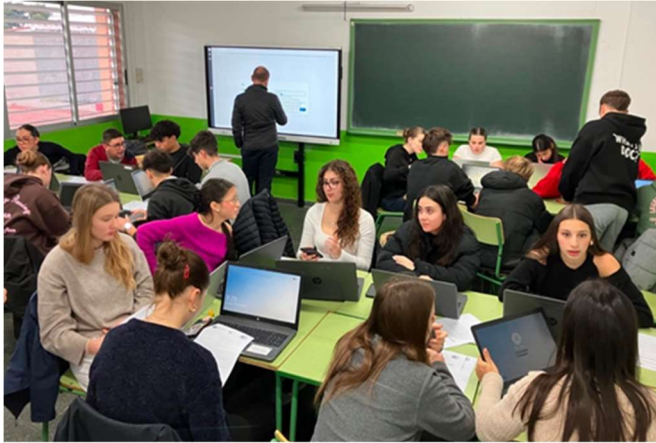
Working on the video blogs

On the final day, we worked together at the partner school, creating video blogs in groups to showcase the week's experiences. Despite challenges such as language barriers (German, Spanish, and French) and technical difficulties, we successfully produced the videos, preserving the memories of our time together.