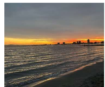
Beach in San Javier

As on every other evening, all the students gathered at the beach promenade to enjoy the sunset.