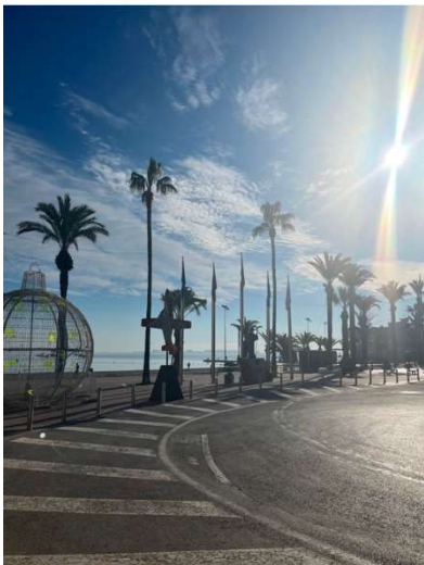
Beach in San Javier

We were warmly welcomed by both the school and our host families, and many new friendships were formed with the exchange students and families, despite some language barriers. The Spanish and French professors praised us highly for our excellent English skills, which we owe primarily to our English teachers.