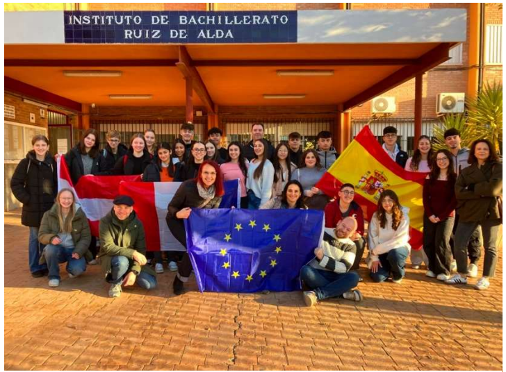
Start of the project „Memoria“