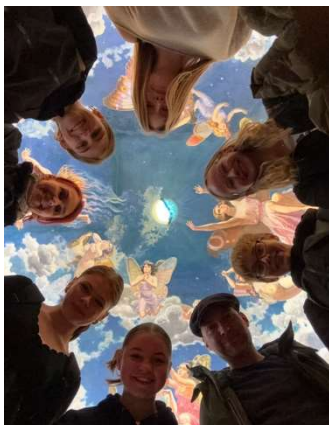
Group picture in the Casino

Before returning, we visited the “Casino”, an impressive neoclassical building now used for exhibitions and events. The old library within was particularly awe-inspiring.